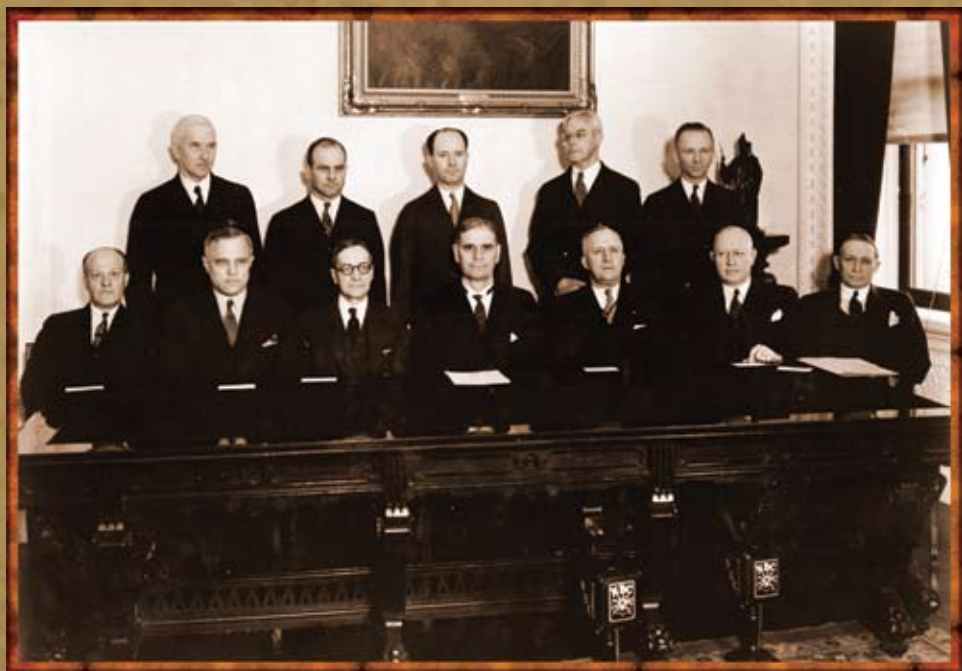
Members of the Baker Board in 1934

Reprinted by permission from Air Force Magazine, published by the Air Force Association