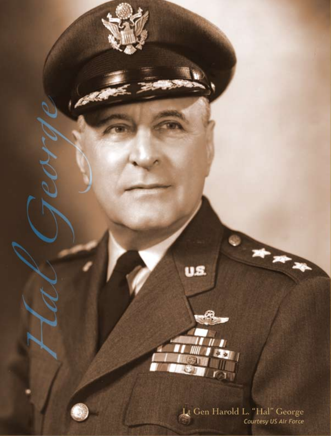
Lt Gen Harold L. "Hal" George