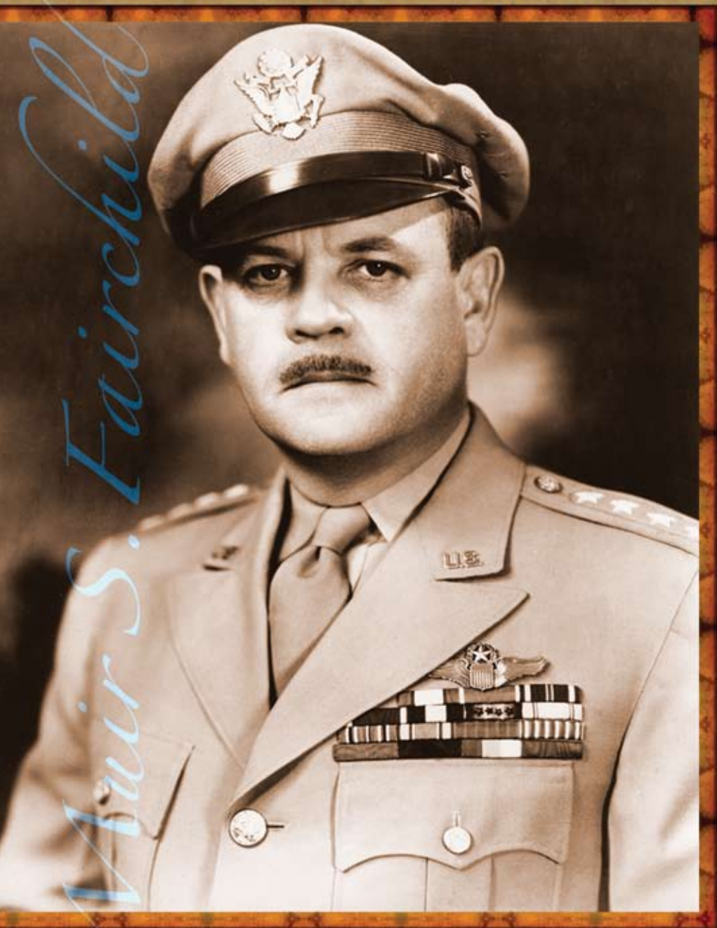
Gen Muir S. Fairchild