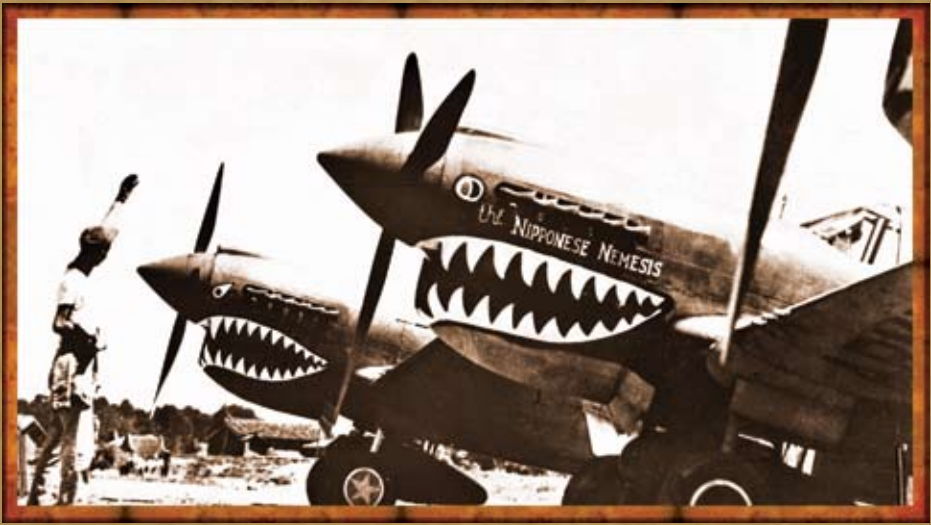
American Volunteer Group "Flying Tigers"