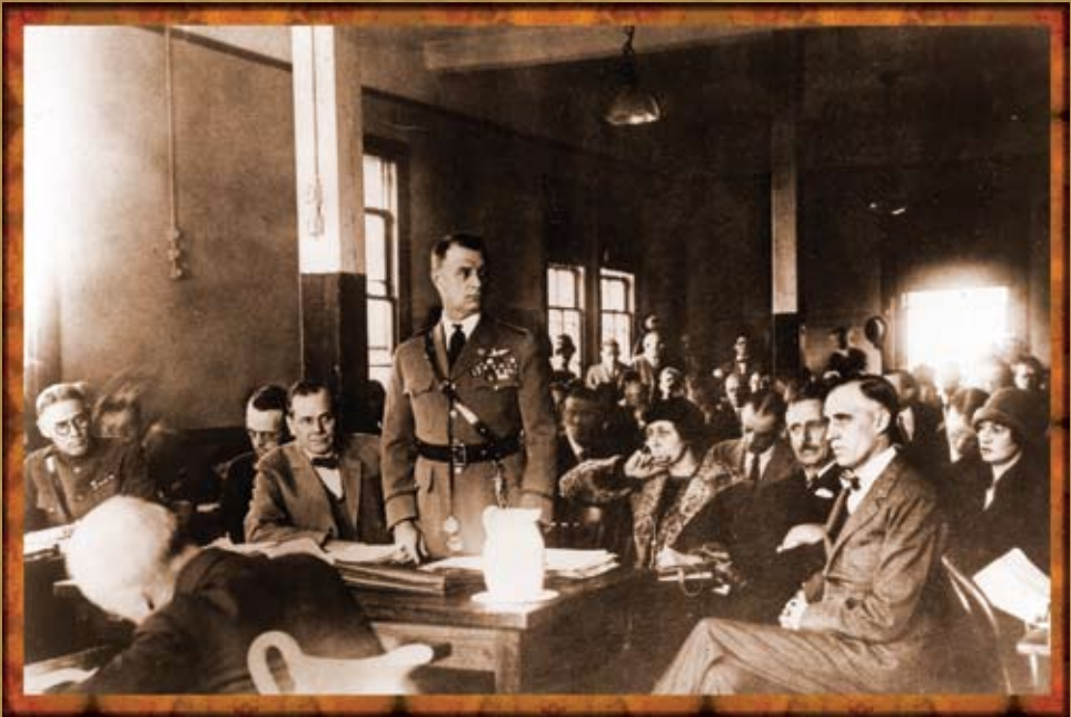
Inside the courtroom during Mitchell's ( standing ) president-directed court-martial for insubordination (1925)