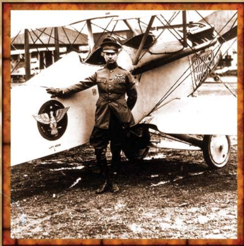
Brig Gen William "Billy" Mitchell standing by a VE-7 at Bolling Field, Washington, DC, air tournament, May 1920. The Vought VE-7 Bluebird was an advanced World War I military trainer, observer, and fighter.