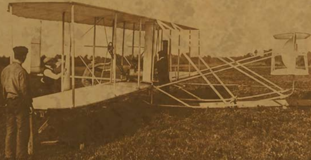
Wright Flyer.