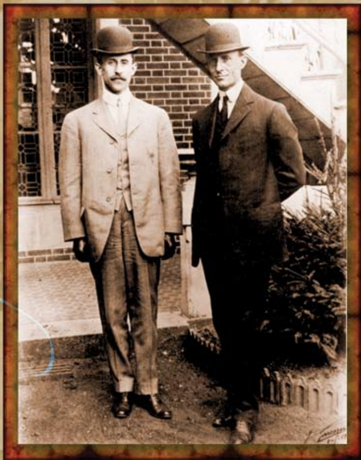
Orville and Wilbur Wright pose for the camera, 1909