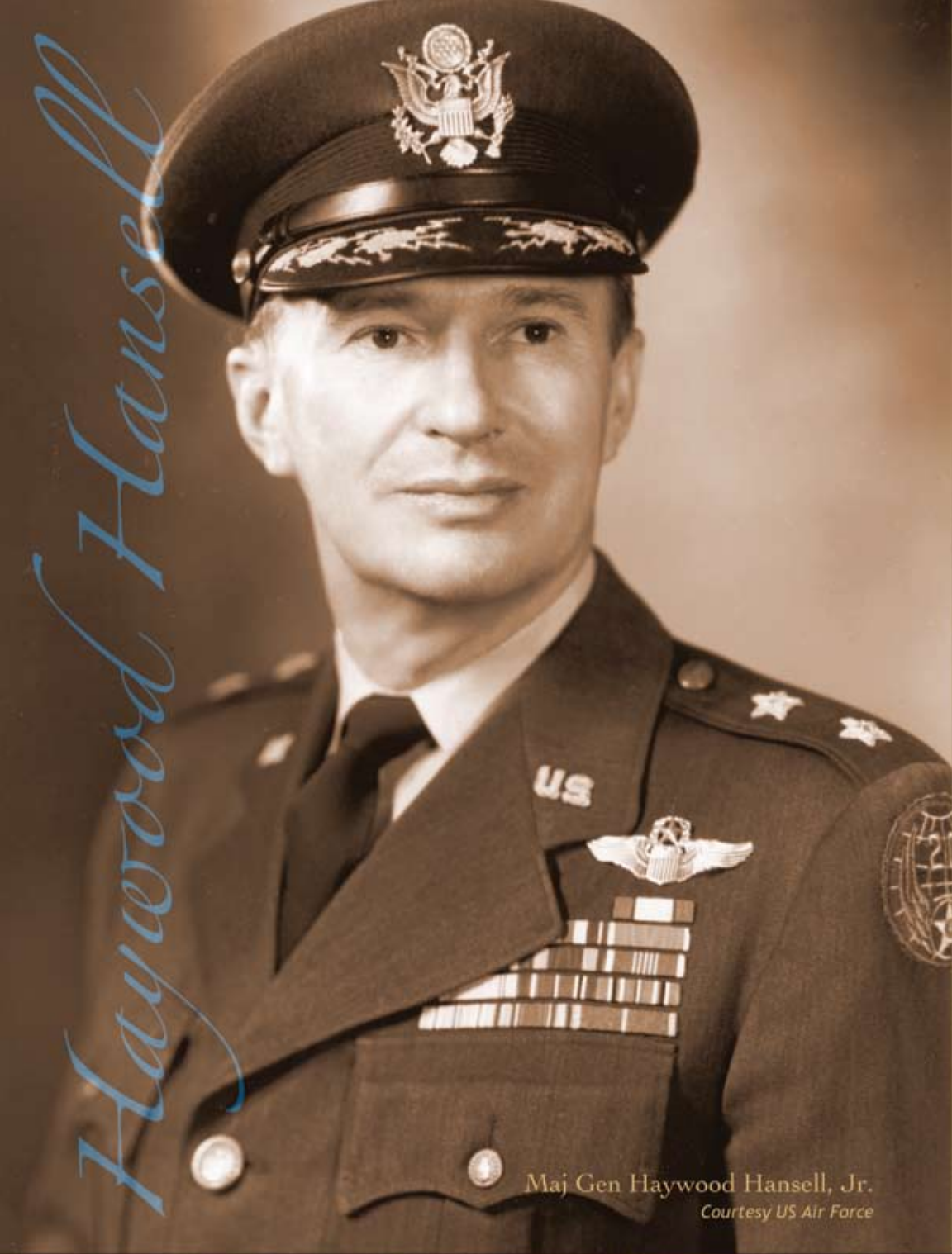
Maj Gen Haywood Hansell, Jr.