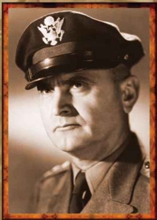
Gen Ira C. Eaker