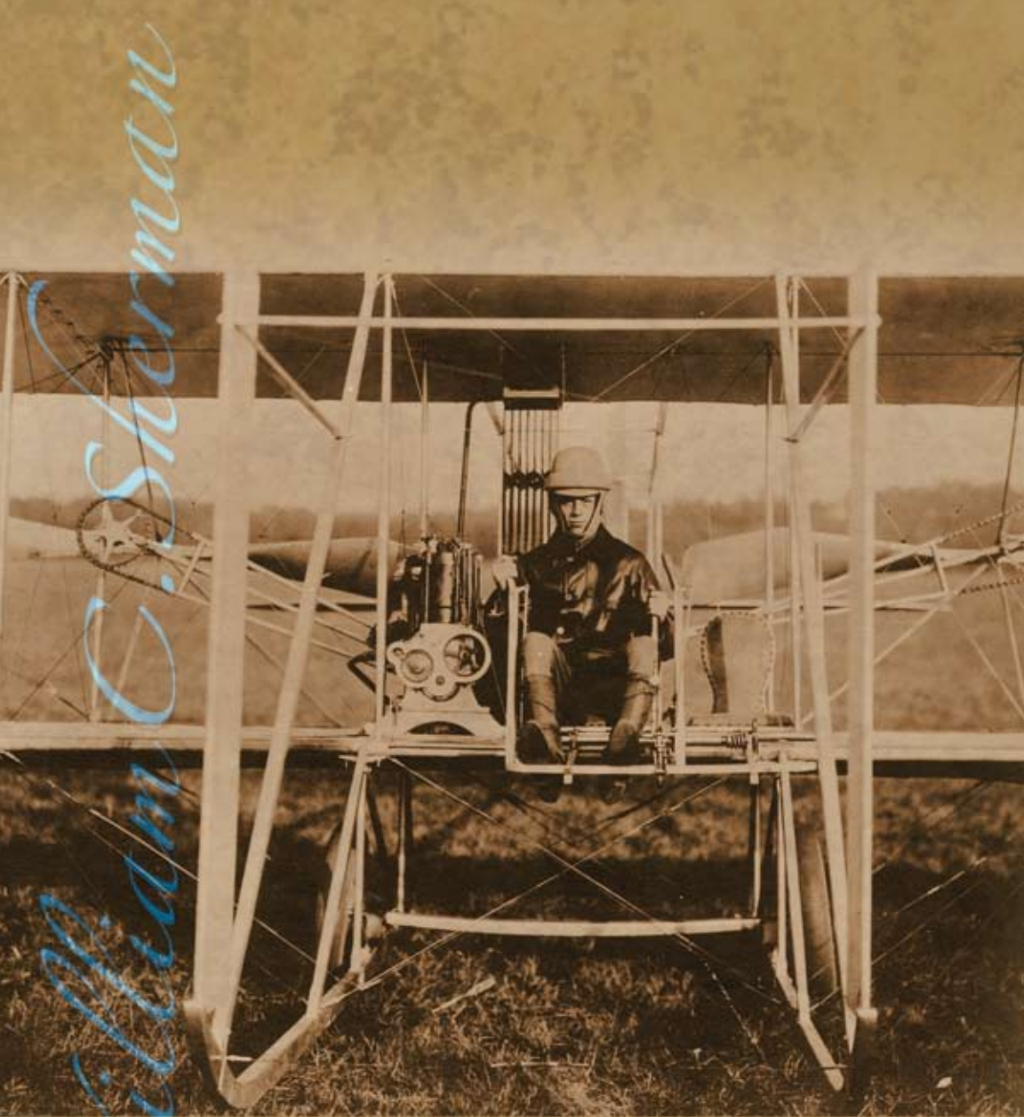
Lt William C. Sherman in a Wright C Flyer at College Park, Maryland, in October 1912