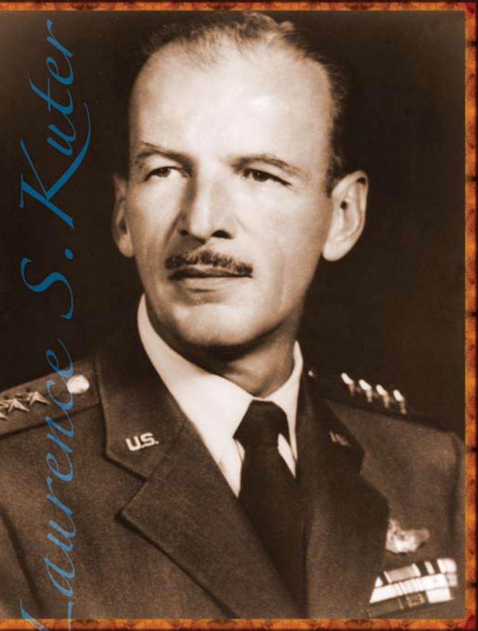
Gen Laurence S. Kuter