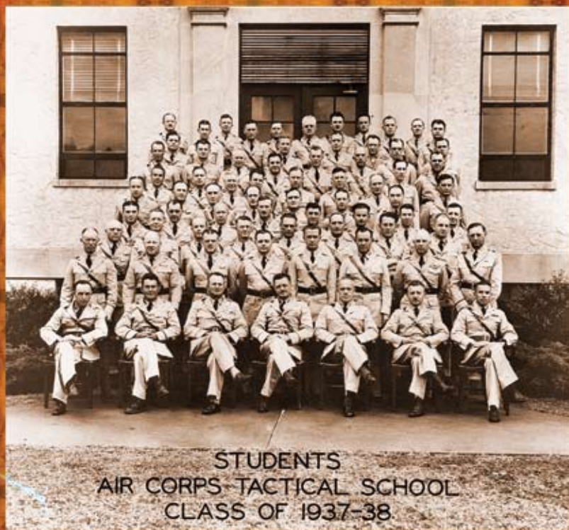
STUDENTS AIR CORPS TACTICAL SCHOOL CLASS OF 1937-38

Air Corps Tactical School, class of 1937