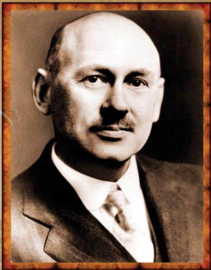
Dr. Robert H. Goddard