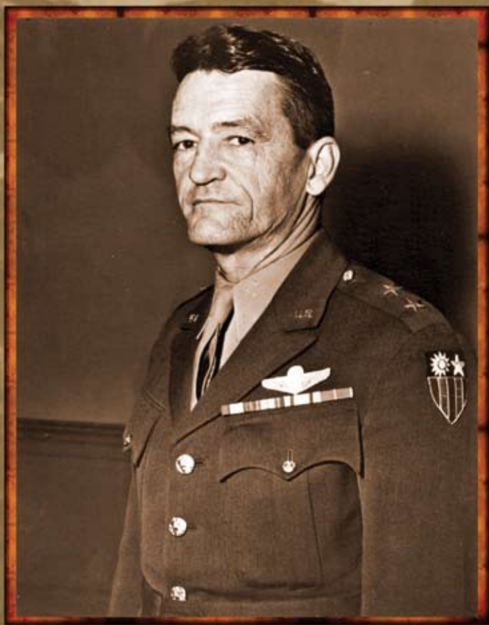
Maj Gen Claire L. Chennault