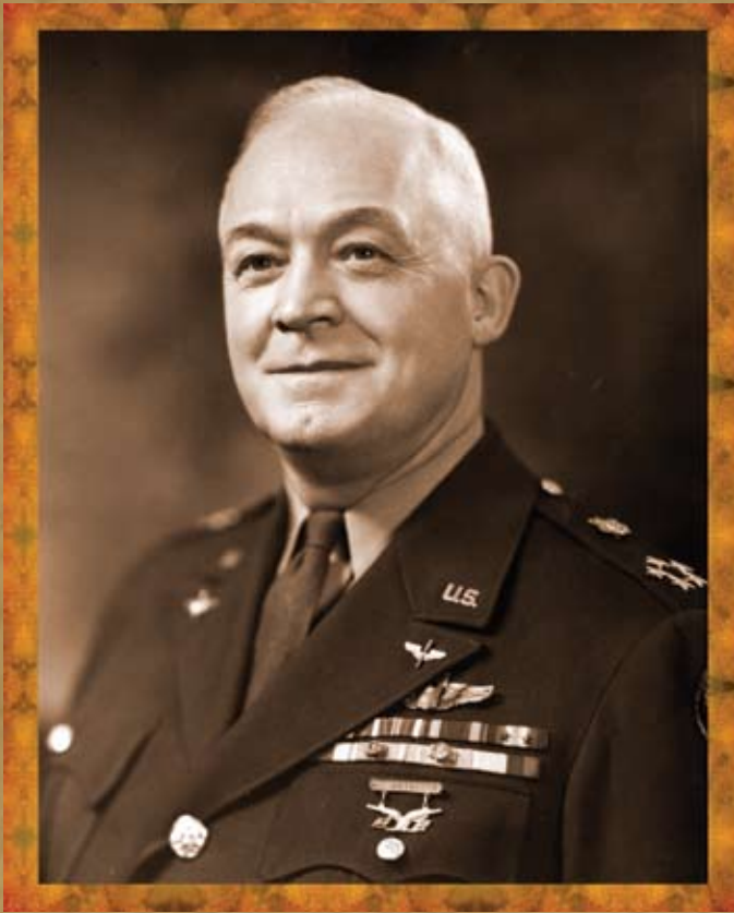
Gen Henry H. "Hap" Arnold